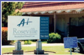
Our first Roseville office is located on Coloma Way at Sunrise Avenue.