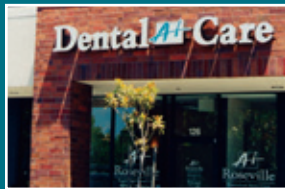
Our second Roseville office is located on Foothills & Baseline in the Bel Air Center, next to Starbucks.