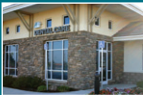
Our Lincoln office is located in the Sutter Medical Plaza on Twelve Bridges Drive.