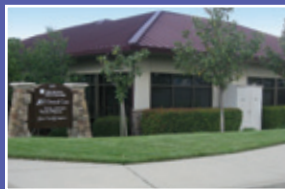
Our Lincoln Hills office is located on the corner of Del Webb Boulevard & Orchard Creek Lane.